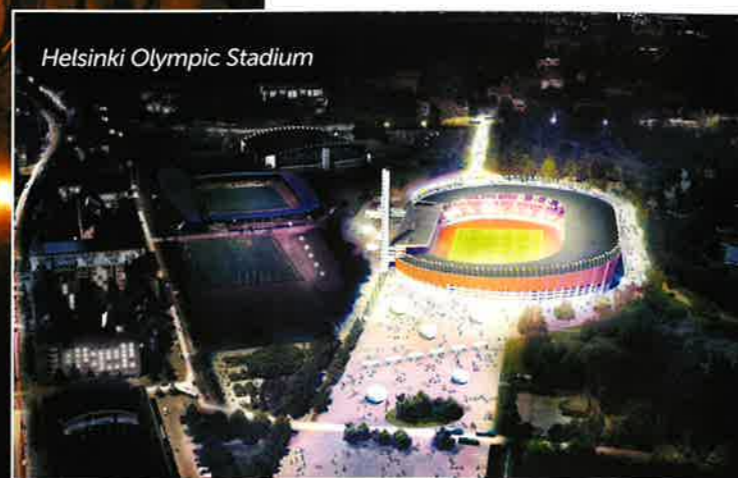
Helsinki Olympic Stadium