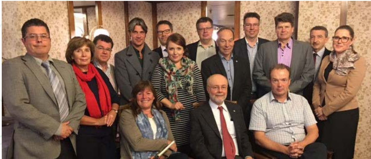
Group photo ITA Board and FTA Board